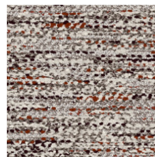
Vibrant Native 81865