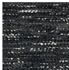
Vibrant Mole 81500